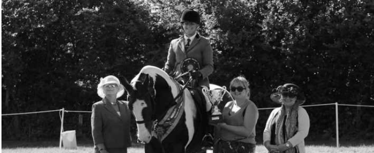
Our 2017 Midarc Champion pictured above

Saturday 1st September at Wood Farm, Gospel End Road, Sedgley DY3 4HA